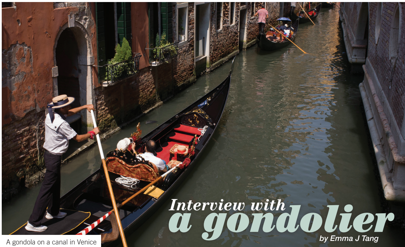
A gondola on a canal in Venice